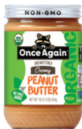
Once Again Organic Peanut Butter selected varieties

Spreading integrity since 1976, Once Again is a 100% employee-owned company that produces clean ingredient nut & seed butters and snacks. Our passionate employee owners take pride in fueling healthy lifestyles with small-batch, high-quality products crafted as close to homemade as possible.