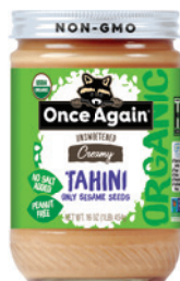
Once Again Organic Tahini