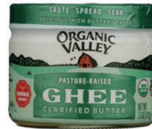
Organic Valley Organic Ghee selected varieties