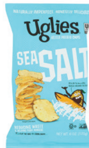
Uglies Kettle Chips Potato Chips selected varieties