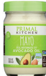
Primal Kitchen Mayo with Avocado Oil selected varieties