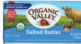
Organic Valley Organic Butter selected varieties

Bring some small family farm goodness to your spring baking with Organic Valley. All Organic Valley dairy products are made with organic milk from pasture-raised cows for undeniably delicious flavor.