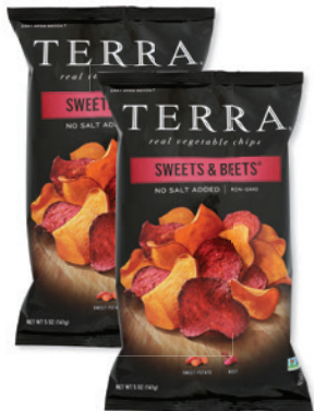
Terra Chips Vegetable Chips selected varieties