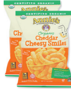
Annie's Organic Cheddar Cheesy Smiles