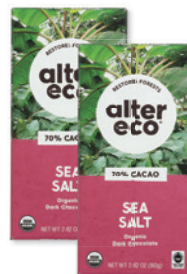
Alter Eco Organic Chocolate Bar selected varieties