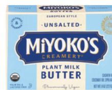
Miyoko's Kitchen Organic Plant Milk Butter