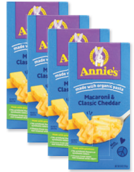
Annie's Mac & Cheese selected varieties