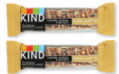
KIND Nut Bar selected varieties