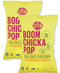
Angie's BoomChickaPop Popcorn selected varieties