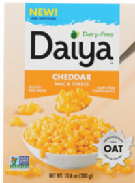
Daiya Deluxe Mac & Cheese selected varieties