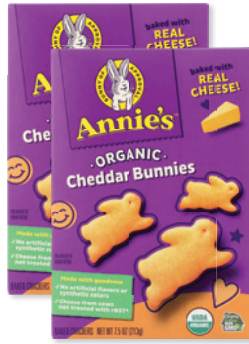
Annie's Organic Bunny Crackers selected varieties

Annie's Promise for Better: a promise to choose nutritious and pantry-worthy ingredients, to add yumminess to every kid's meal, and to use organic ingredients that are forever kind to the planet.