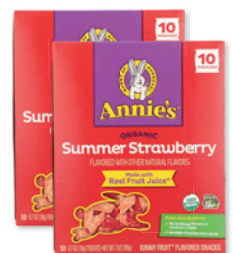
Annie's Organic Fruit Snacks selected varieties