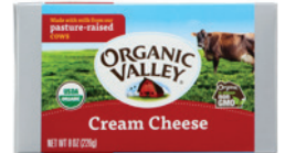
Organic Valley Organic Cream Cheese selected varieties